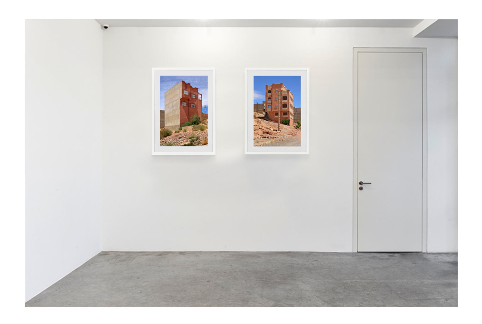
5 – série nouvelles constructions Tinghir Maroc 2017